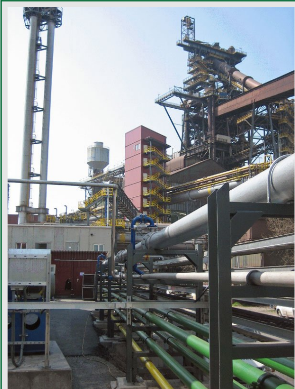
Injection plant with EKOFOR-plant in the background