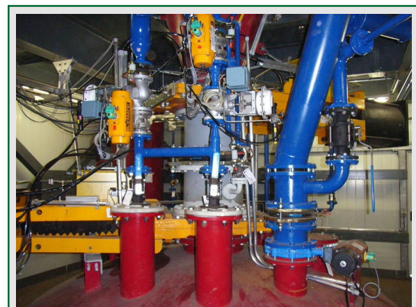
Upper part of the distributor vessel