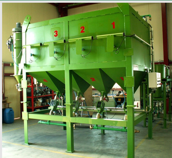
Storage tank for 4 casting powders

Installations for metering of granulated flux powder directly onto the mould of continuous casting machines such as slab, bloom, beam blank and billet casters for improvement of surface quality of the strand and economy of flux