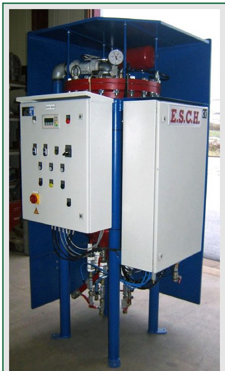
Suction pressure Feeder