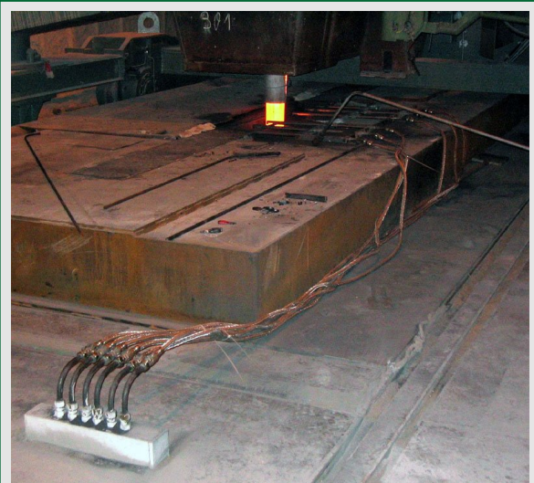
Conveying pipelines to the distributor